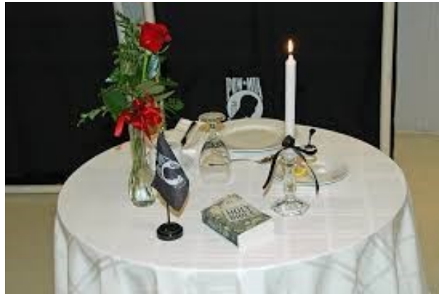
"A MISSING MEN AND WOMEN TABLE"

"The Missing Men and Women Table" consists of a small, round bistro table, a white tablecloth, a single place setting, an inverted wine glass, a salt shaker, a slice of lemon on a bread plate with a pile of spilled salt, a bible, a small bud vase with a RED ribbon tied around it containing a single long stem red rose, a lit candle, and an empty chair.