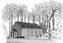
Christ Church Parish