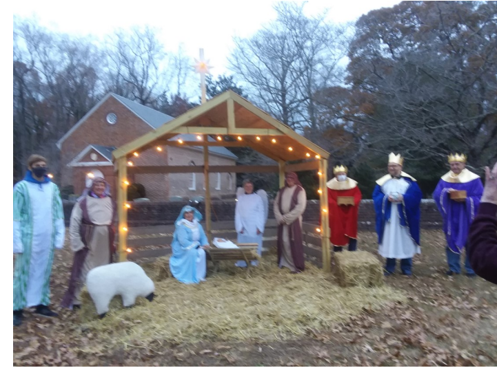
Christ Church Parish (Episcopal) live Nativity

EDITORS NOTE: In 1224 St. Francis of Assisi created the first live Nativity as a portrayal to enhance his sermon on the miraculous event.