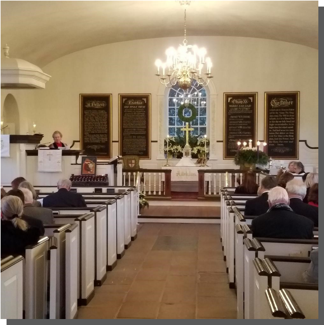
See more pictures on Page 15.

This service is always one of the best attended and loved service we hold during the year. It would have been a larger crowd of worshipers, but many of our regular worshipers leave to visit family and worship with them in their churches.