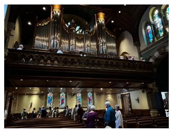
Rehearsal at Sewanee Church Music Conference