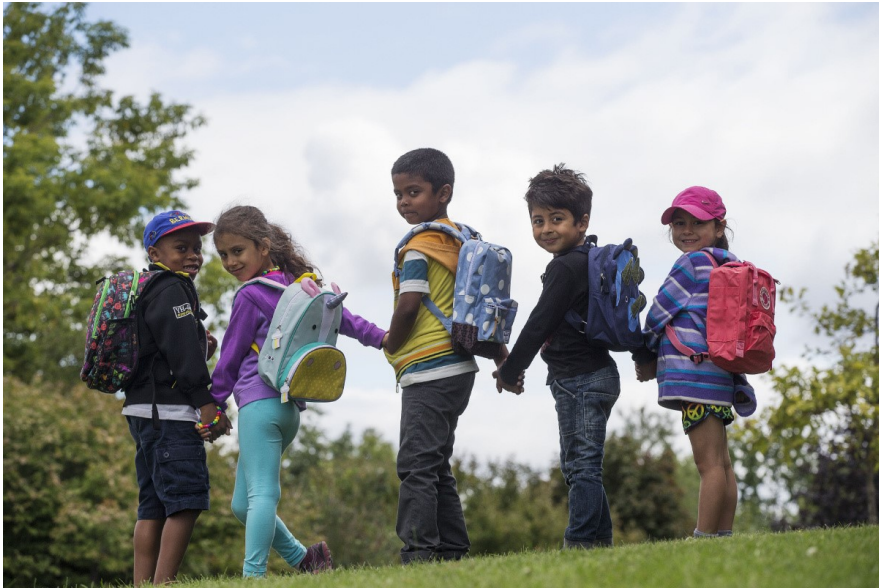
Looking forward to next year!