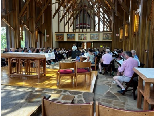
Rehearsal at Sewanee Church Music Conference