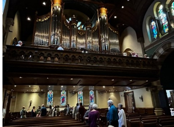
Organ at Christ Church Cathedral, Nashville

My vacation in Nashville and the following week at the Church Music Conference at Sewanee were both inspiring and disappointing. In Nashville, I attended Sunday Eucharist and an evening Taize service at the Episcopal Cathedral. And yes, I went to the Grand Ole Opry. At Sewanee, the caliber of music presented was beyond my expectations. Led by the head of music at St Thomas Church in New York, the choir of 130 worked diligently for a week to learn and present some of the most difficult choral works I've ever encountered. Unfortunately, I contracted bronchitis early on and was unable to fully participate in the incredible singing opportunities at the conference. However, I came back with several new friends from Sewanee and had a wonderful time in Nashville with my cousin from Natchez.