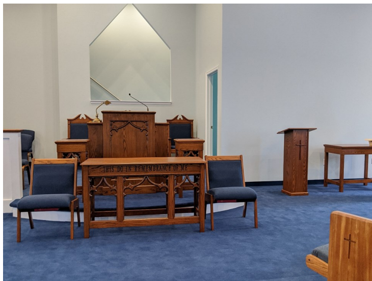
St. Paul’s Altar furniture